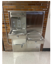
New Water Fountains