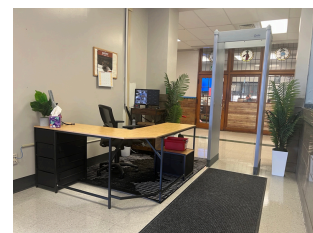
Welcome to Long